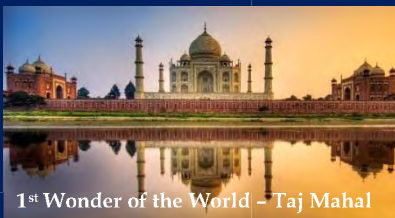
1 st Wonder of the World – Taj Mahal